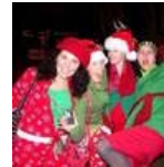
Atlanta holiday season guide Your 2011 planning guide for Thanksgiving restaurants and...