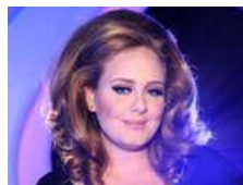
music » New music: in stores and online