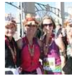
Atlanta Half Marathon and the Thanksgiving Day 5K 2011 Holiday race presented by the Atlanta Track Club