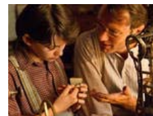
movies & tv » Metromix picks: Best new movies