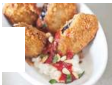
restaurants » Atlanta restaurant news: Nov. 30-Dec. 6