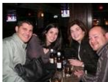
events » Atlanta weekend events: Dec. 1-4