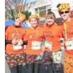
Undy 5K 2011 Running in underwear to fight Colon Cancer