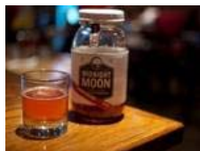
bars & clubs » Drink of the Week: Moonshine Cocktails